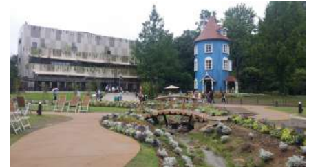
The blue Moomin house

Some houses require an extra ticket. Going to the tall blue Moomin house is a must (cost 1000 ¥). The Moomin house has three floors and a basement. The first floor of Moomin house contains the kitchen and the living room, while the other rooms are upstairs. The main food storage is in the basement. The guide, Sari Yoshihara gives a vivid explanation about different things in the house. Sari also knows good Finnish and points out some words.