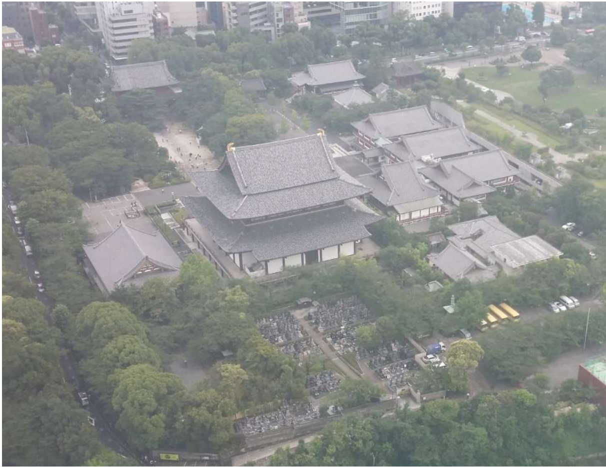
Zojoji temple as seen from the main floor of Tokyo tower.