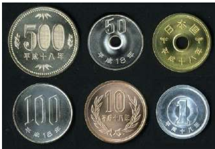
Yen coins in Wikipedia.

Matcha is finely ground green tea. Japanese tea is made by using matcha, which is added to a bowl of hot water or milk and mixed to have even consistency. In Joensuu, it can be best enjoyed in Mokkamaa in Kauppakatu 25.