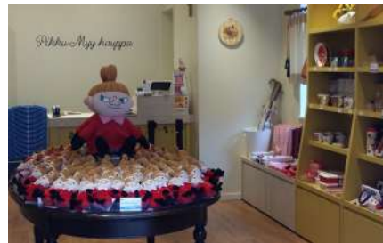
Pikku Myy shop

The entry costs 1100 ¥. The area is 1.5 km long walk next to Lake Miyazawa. There are small shops and buildings along the way, each having a Finnish name. There are many beautiful things to buy in the small shops. The main item to buy is a mug.