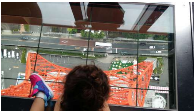
Tokyo Tower is 333 m high, while the main floor is 150 m above ground.