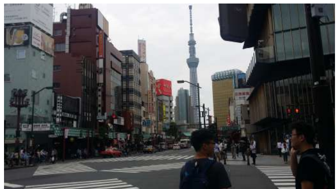
Tokyo Skytree is 634 m high, but Juha-Matti did not go there.